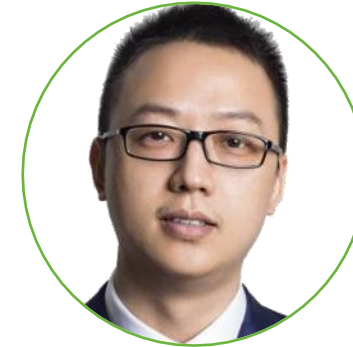
Eddie Wu CEO Alibaba Group