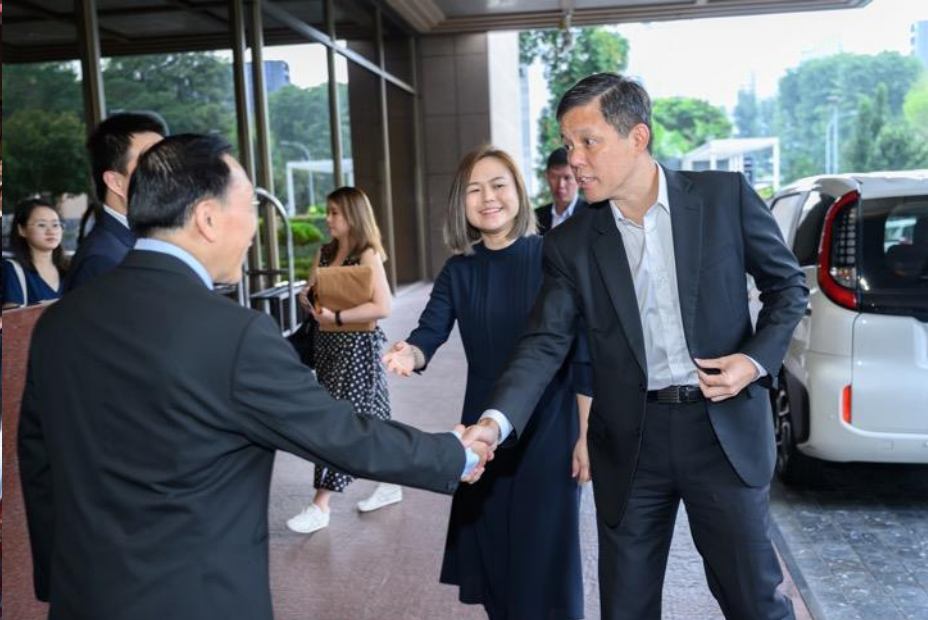
Singapore Valley Awards 2024